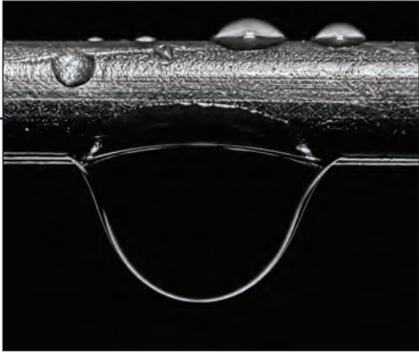
IP67 Ratings: Competitors failed with water in the jacket.

No shielding in the 90-degree bend means this cordset is not 100% shielded.